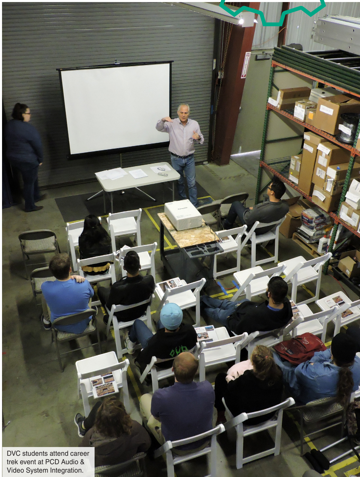
DVC students attend career trek event at PCD Audio & Video System Integration.

program in a variety of ways. Most recently, they hosted a career trek event at their company. DVC students toured the company and learned about career options. They talked with employees as well as a union representative.